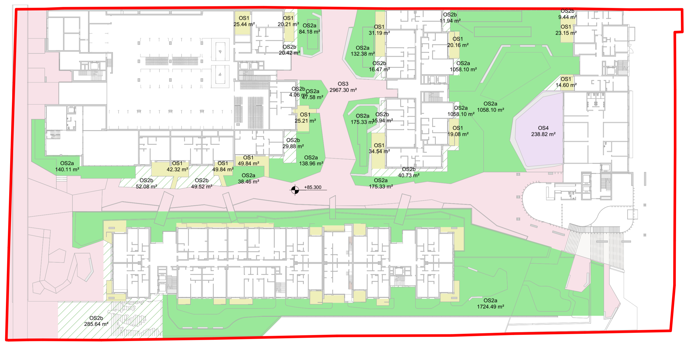
2 O1 Level 1 Boulevard Crd. Floor O.S. 1:500