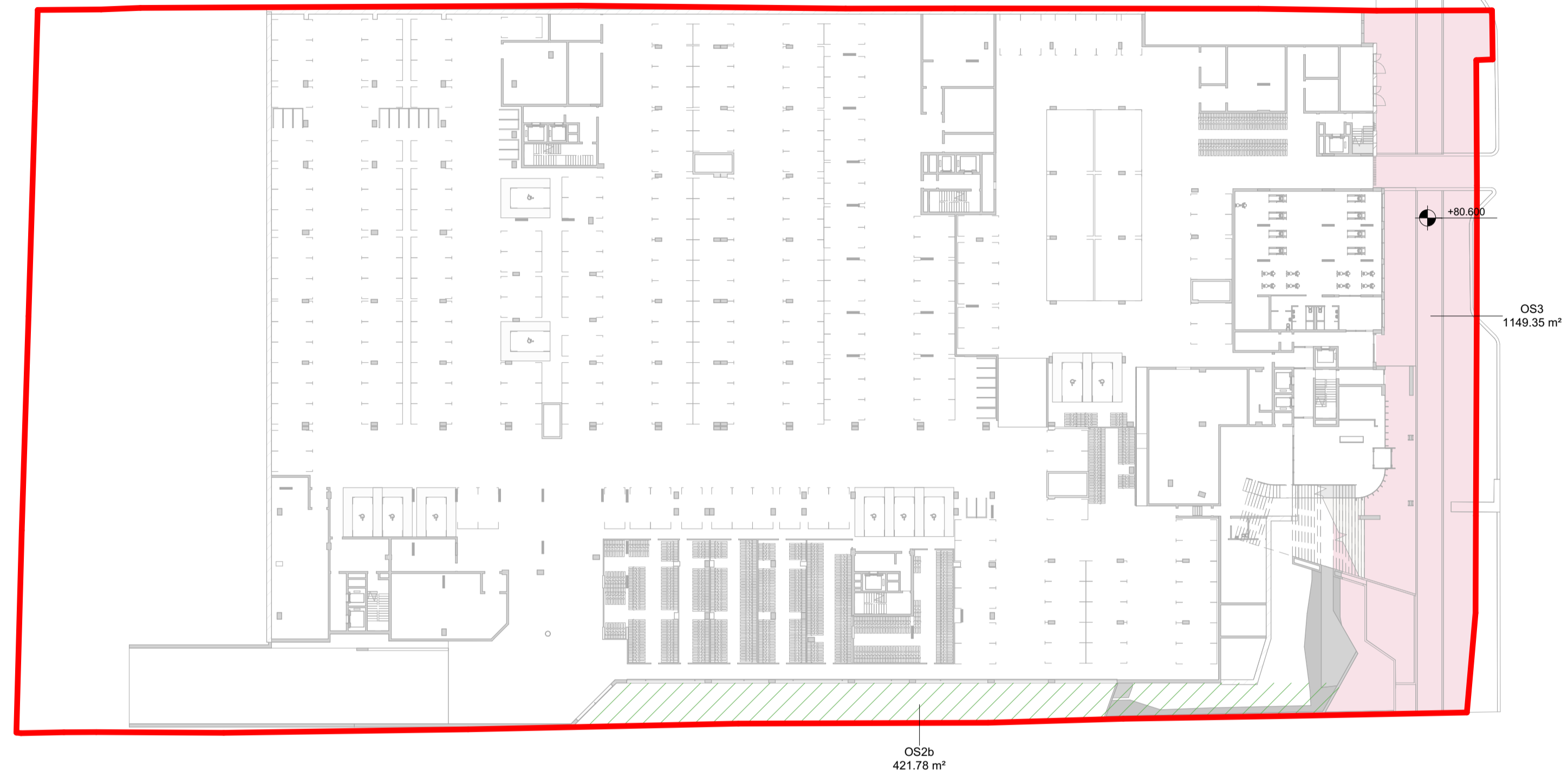
1 OO Level 0 Lower Ground O.S. 1:500