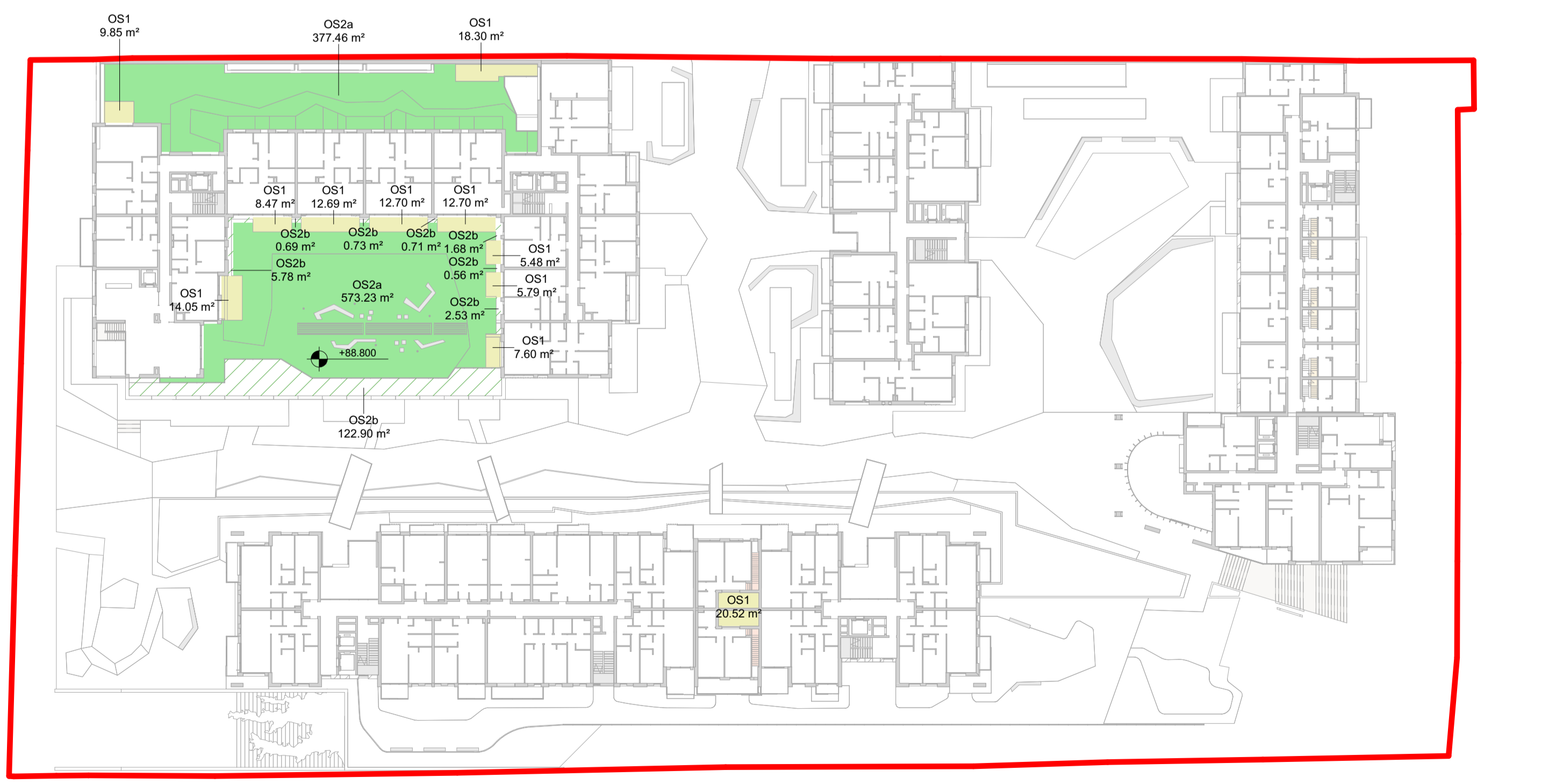
3 O2 - Level 2 O.S. 1:500